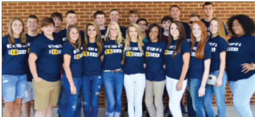
Class of 2016's Last First Day