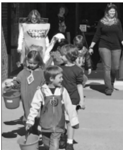
Kindergarten students having fun!